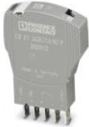
Electronic device circuit breaker, 1-pos., active current limitation, 1 N/C contact, plug for base element.

Please be informed that the data shown in this PDF Document is generated from our Online Catalog. Please find the complete data in the user's documentation. Our General Terms of Use for Downloads are valid ( http://download.phoenixcontact.com )